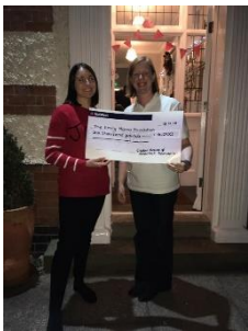
Cedar House Presentation

There have also been many individuals and groups who have donated or done other fundraising for us but are too many to list here. We sincerely thank all of these people for all of their efforts.