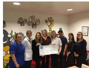
Fidler & Pepper Presentation