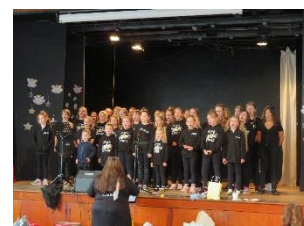
Star & Stage Musical Theatre School