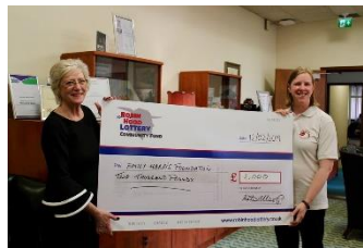
Robin Hood Lottery Community Grant presented by the Executive Mayor