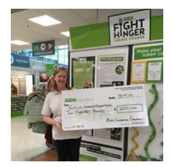
Asda Cheque Presentation