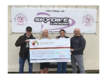
Our Four Sykdivers