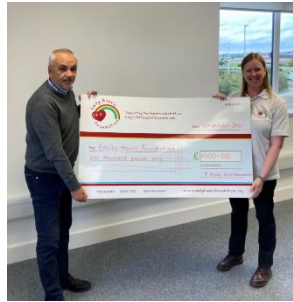
T Bailey Asset Management