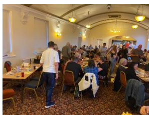
Race Night in full swing!

We finally got to enjoy our first full fundraising event since before the pandemic with a return of the popular Race Night in May. Thank you to everyone who supported this event in any way and we are particularly grateful to the Rufford Pub who stepped in to be our venue at the last minute. We are delighted that as a result of this, the pub is looking to work with us as their Charity partner in the coming months.