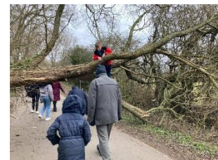
Walking around the Reservoir

Our fundraising activities remained restricted for the first half of this financial year and we were grateful to all those who supported our Virtual Balloon Race in December. However, we were delighted to be able to begin meeting face-to-face again in the New Year – firstly with our inaugural Last Mile Together event. This involved people taking on their own individual challenges during the month of January and then meeting together on 30 th January to complete the Last Mile Together. This saw a great number of supporters walking around King’s Mill Reservoir before enjoying hot chocolate and cakes served from the boot of the car!